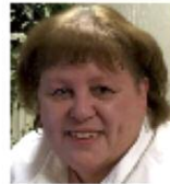
Grace Farmer Governor-Elect Bartlesville

240 SE Rockwood Ave Bartlesville, OK 74006