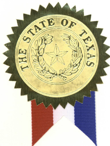
Rick Perry Governor